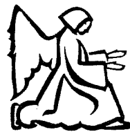
Diocesan Annual Appeal