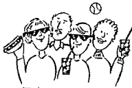
Take me out to the Ball Game!

THE RUDOLPH AREA RUMMAGE SALE is Saturday, April 28. The Friends of St. Philip Youth will again have a sale and Brat Fry in Wagner Hall. Please don't bring items to church until the week before as we have limited storage space. Thank you.