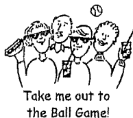
Take me out to the Ball Game!