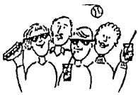
Take me out to the Ball Game!