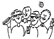
Take me out to the Ball Game!