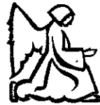
Diocesan Annual Appeal