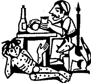
Lazarus longed to eat the scraps that fell from the rich man's table →