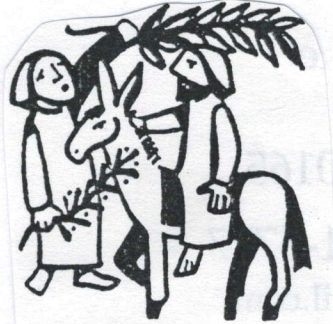
Hosannah! Blessed is He who comes in the name of the Lord