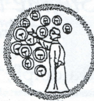
All Saint's Day

The Annual Diocesan Annual Appeal begins today. Our target this year is $25,280. Information and pledge cards will be mailed to your home.