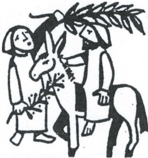
Hosanna! Blessed is He who comes in the name of the Lord

HOLY THURSDAY OFFERTORY COLLECTION will be for Catholic Charities, as well as the donations from Stations of the Cross. Donations will still be accepted after Easter.