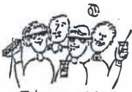
Take me out to the Ball Game!

SPRING EVENT: May 28 - SVDP Talent Show - p.m.